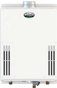
Heavy-Duty Commercial Gas Models