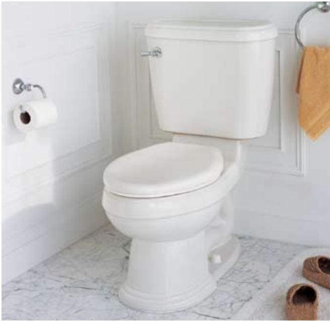
Oakmont Champion 4 Two-Piece Toilet • Right Height Elongated • Elongated • Round Front

Both our new Compact Cadet 3 Right Height one-piece and two-piece elongated toilets will fit easily into a round front space, so you can have an elongated bowl in a smaller space without sacrificing comfort.