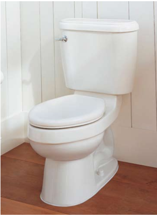
Doral Champion 4 Two-Piece Toilet • Right Height Elongated • Elongated • Round Front