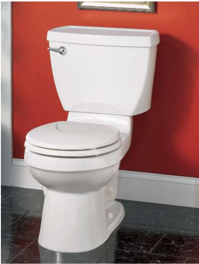
Champion 4 Two-Piece Toilet • Right Height Elongated • Elongated • Round Front