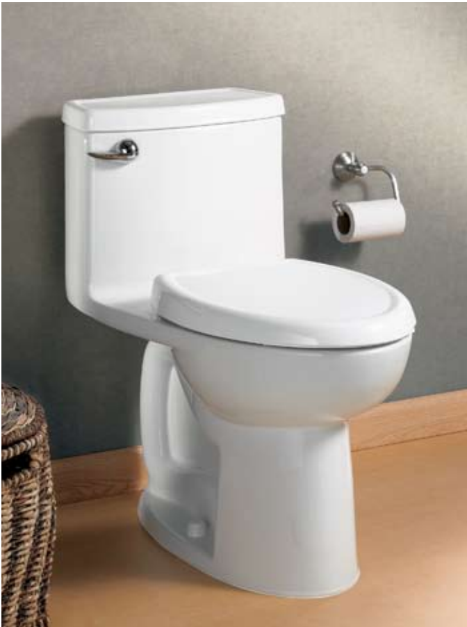
Compact Cadet 3 One-Piece Toilet • Right Height Elongated