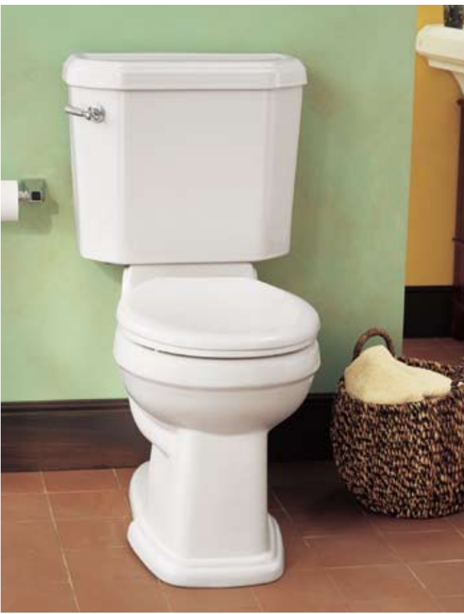
Townsend Champion 4 Two-Piece Toilet • Right Height Elongated • Right Height Round Front