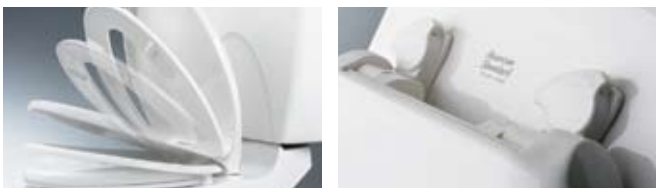
The Champion Slow-Close Toilet Seat prevents lid slamming. Its tool-free, lift-off design allows for easy cleaning and quick cleaning.