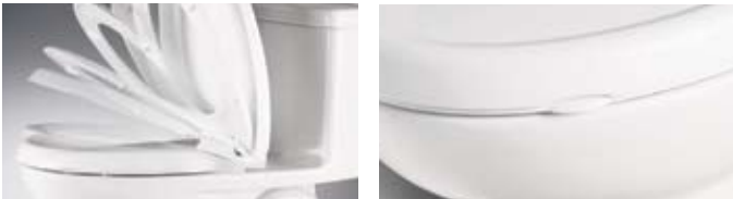
The EverClean Slow-Close Seat. The lid features Finger-Lift Access.