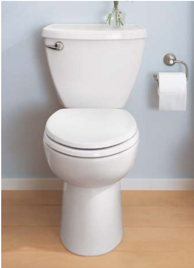
Cadet 3 Two-Piece Toilet • Right Height Elongated -10", 12", 14" Rough-in • Elongated -10", 12", 14" Rough-in • Round Front -10", 12", 14" Rough-in

Keeping a toilet clean. What was once a headache is now an afterthought. The EverClean surface can actually help your toilet keep itself clean. And it's only available from American Standard.