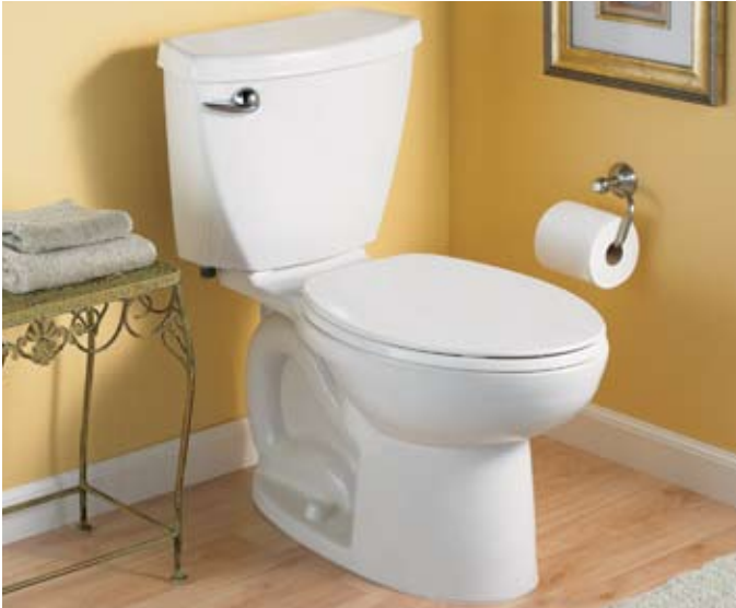
Compact Cadet 3 Two-Piece Toilet • Elongated