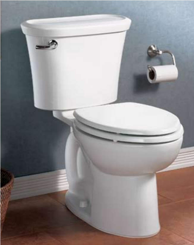
Tropic Cadet 3 Two-Piece Toilet • Right Height Elongated • Elongated • Round Front

Both our new Compact Cadet 3 Right Height one-piece and two-piece elongated toilets will fit easily into a round front space, so you can have an elongated bowl in a smaller space without sacrificing comfort.