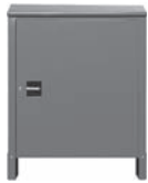
Aluminum Hose Cabinet