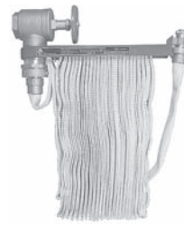
Hose Rack Assembly, 2 1/2" x 1 1/2"