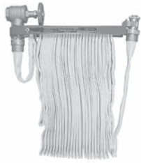
Hose Rack Assembly, 1 1/2"